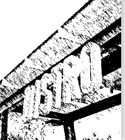
Chancellors Tavern, Sippy Downs